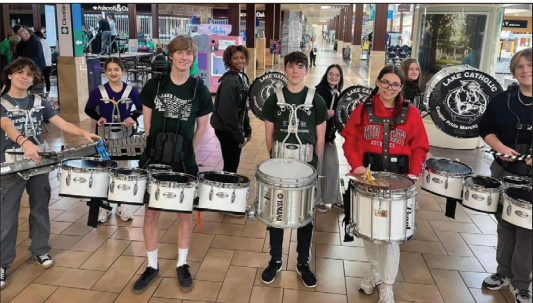
The Lake Catholic High School Drum Line volunteered their time for March for Meals.