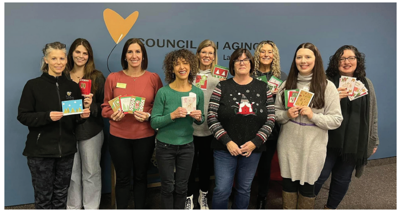
A group of community representatives donated their time to create handmade holiday cards for homebound seniors.